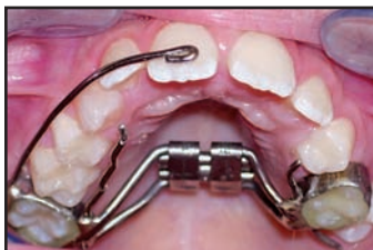
158 Modified Hyrax